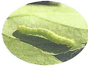
Fig. 3 Wintermoth Caterpillar