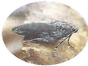
Fig. 2 Female Wintermoth