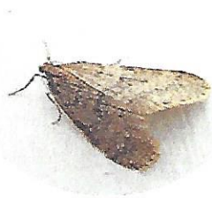
Fig. 1 Male Wintermoth