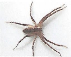
Nursery Web Spider